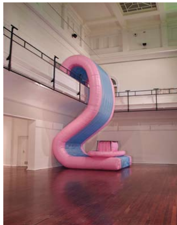
Jurek Wybraniec, Wall, Floor, Rug and Table combo#1 2008 (installation view PICA) Courtesy of the artist and Goddard de Fiddes Gallery, Perth. Photo: Tony Nathan

There is a sense of alchemy underpinning Benjamin Armstrong's suite of pastel-coloured prints tilted Sorcery (2008). As one spends time with his images they appear to continuously dissolve and reform in a chain of correspondences and associations that morph endlessly into one another. Resembling a strange anatomy or even cosmology, the prints combine notions of extraordinary fecundity alongside suggestions of decay. At once compelling and repulsive, the organisms and energies inhabiting these works escape categorisation but nonetheless connote the cycle of life and death. Installed in the shape of a shallow and pale rainbow-like arc, Armstrong's prints form an entry point into realms outside the effable.